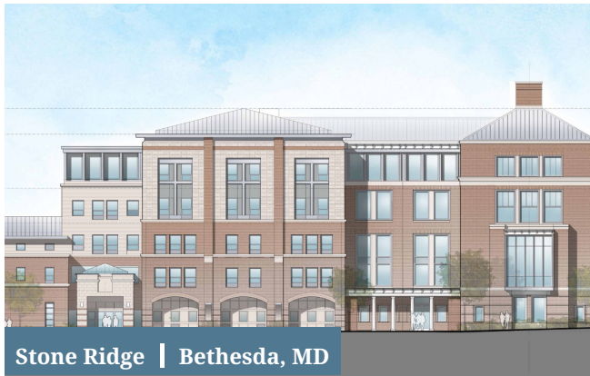
Stone Ridge | Bethesda, MD

This project consists of a 5-story approximately 25,600 SF addition and a systemic renovation to approximately 48,000 SF of the existing school to a STEM school located in Bethesda, Maryland.