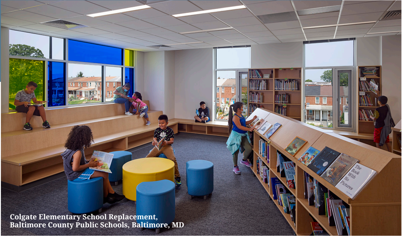
Colgate Elementary School Replacement, Baltimore County Public Schools, Baltimore, MD