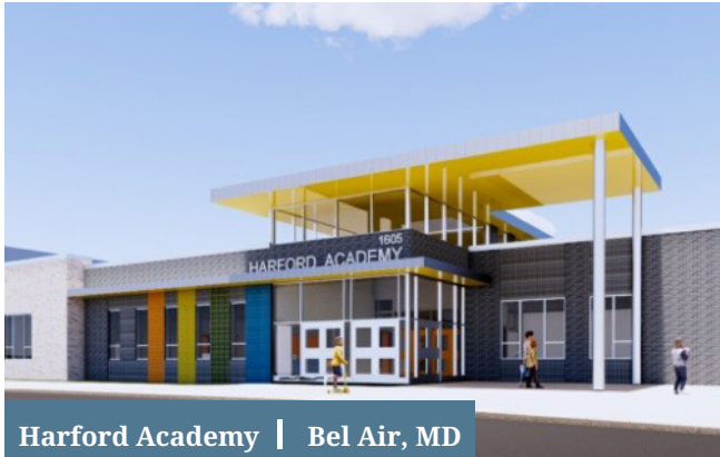
Harford Academy | Bel Air, MD

The new Combination Harford Academy and Elementary School includes a Public Day School for students with intensive special needs and a conventional elementary school.