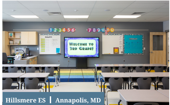
Hillsmere ES | Annapolis, MD

The building uses a four-pipe heating and cooling system with high-efficiency chillers, N+1 condensing boilers, central VAV air handling units, and dedicated systems for large-volume spaces. The design includes HVAC redundancy and places all routinely serviced equipment in mechanical rooms and penthouses. The project is targeting LEED Silver certification. Design: 2026, Construction: 2028, Cost: $125M